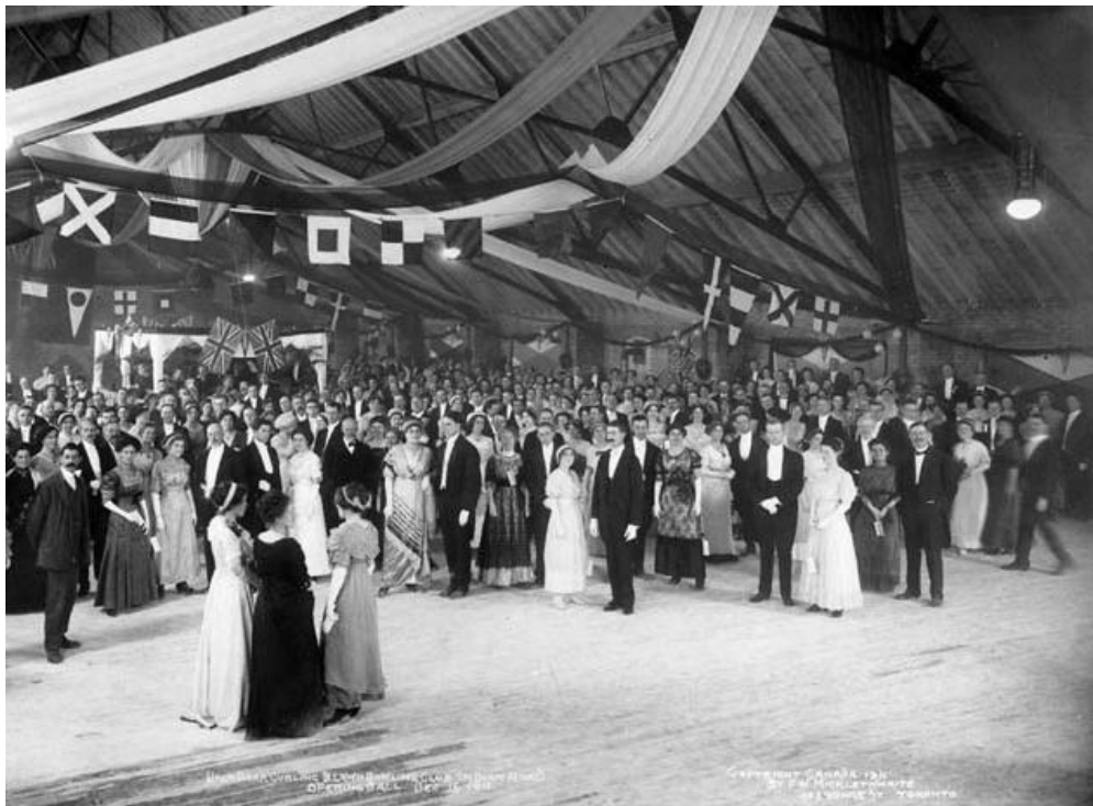
High Park Curling and Lawn Bowling Club, Indian Road, Opening Ball, December 15, 1911